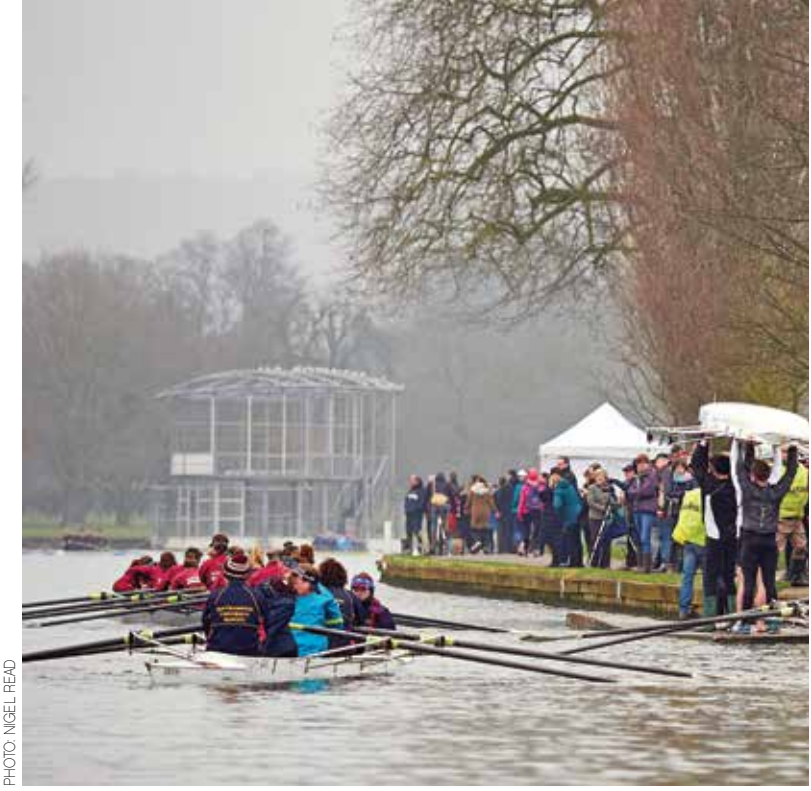
Below: A chance to row on one of the most historic courses in the UK at Henley Fours and Eights Head