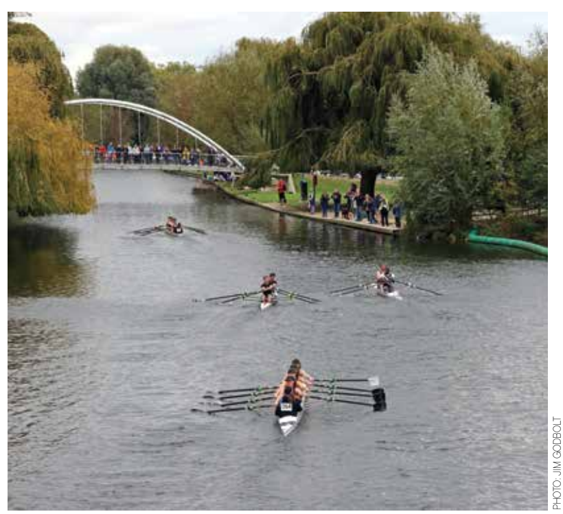
Above: Spectators can get close to the action at Bedford Autumn Head

THE USA OFTEN CLAIMS IT DOES EVERYTHING 'BIGGER AND BETTER' AND IN THE CASE OF THE HEAD OF THE CHARLES REGATTA IT'S TRUE! I